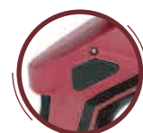
Pressure release button