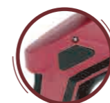
Pressure release button