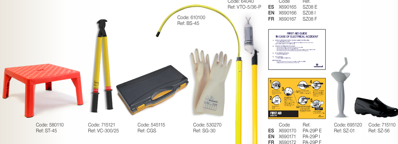
Code: 580110 Ref: ST-45

Product supplied with screws and nail plug (to hang).