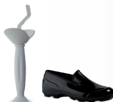
Code: 695120 Code: 715110 Ref: SZ-01 Ref: SZ-56